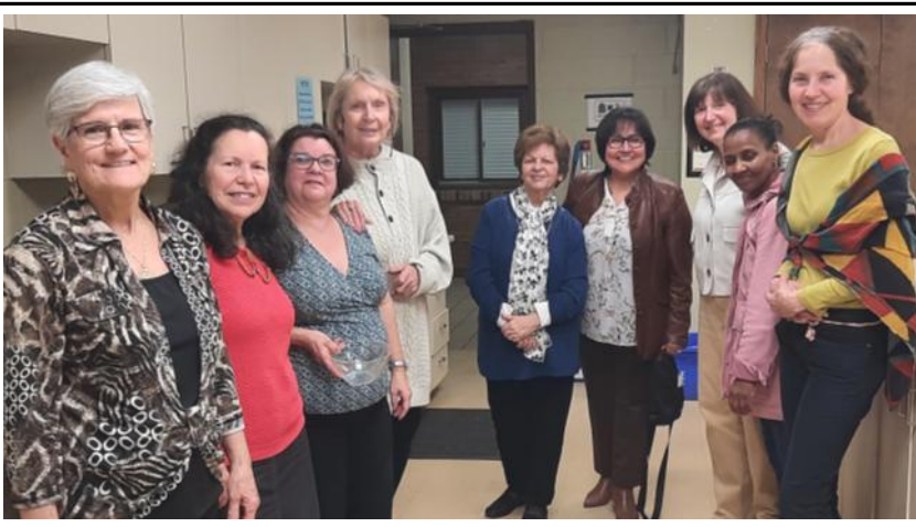
St. Joseph Spiritual Retreat - helpers