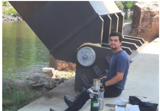
lunch hobo style – can of beans on the burner