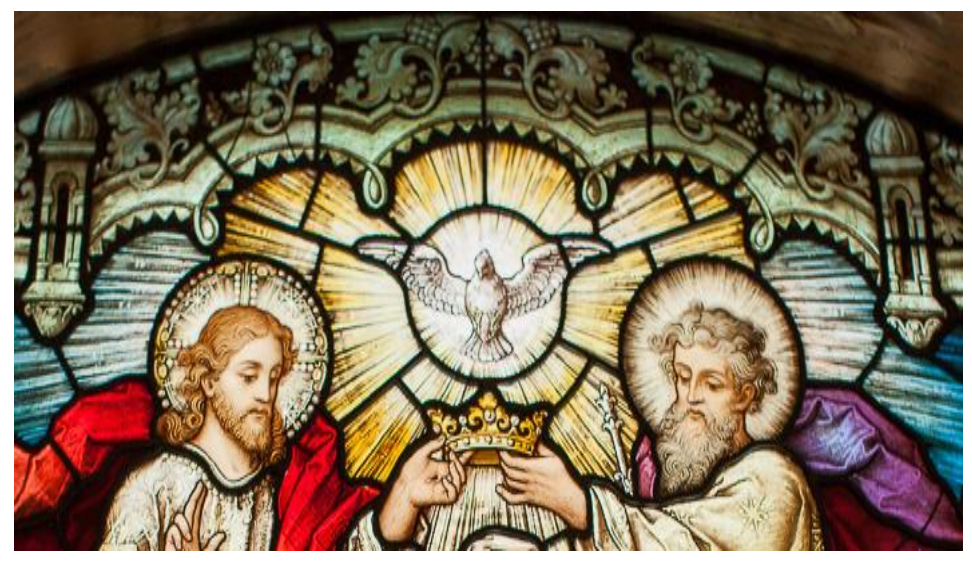
The Solemnity of the Most Holy Trinity

A Catholic Community of Faith in Cambridge since 1967