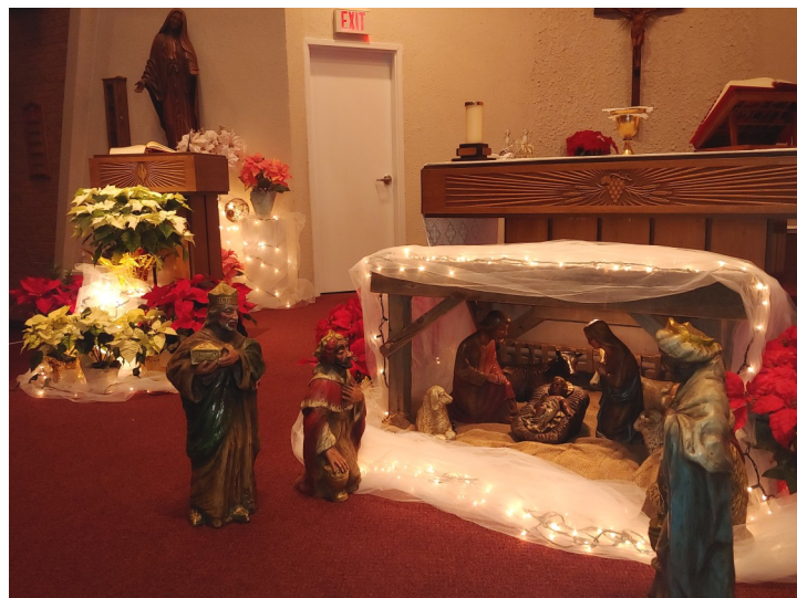
The Magi arrived !!!