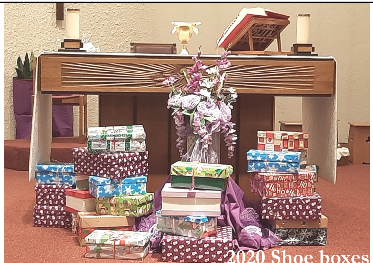
2020 Shoe boxes